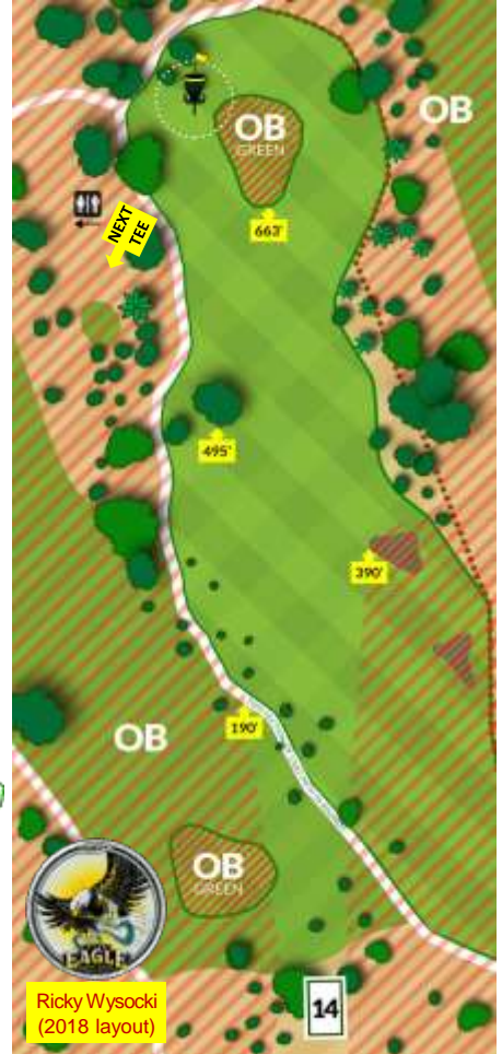
Ricky Wysocki (2018 layout)

OPEN AGED PROS AMS 2020 / 2019 Average Preliminary Round Scores Men 3.2 / 3.4 3.3 / 3.5 3.7 / 3.6 Women 3.5 / 4.0 4.1 / 4.1 4.4 / 4.5