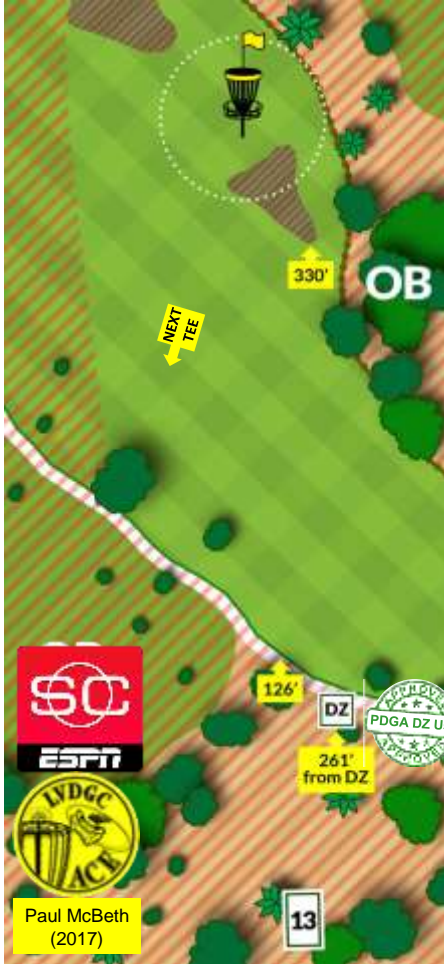
Paul McBeth (2017)